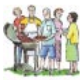
Church Pot Luck