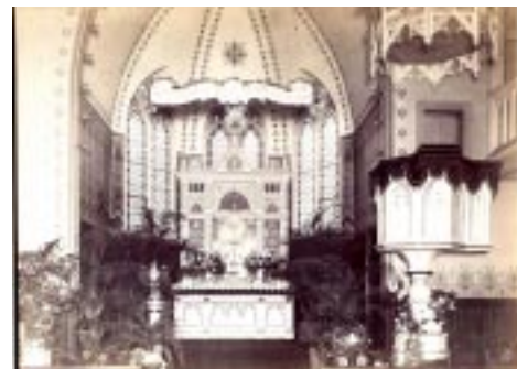
Interior of the 1866 Church - Historic Trinity's 2nd Church

All prices are estimates at time presented.